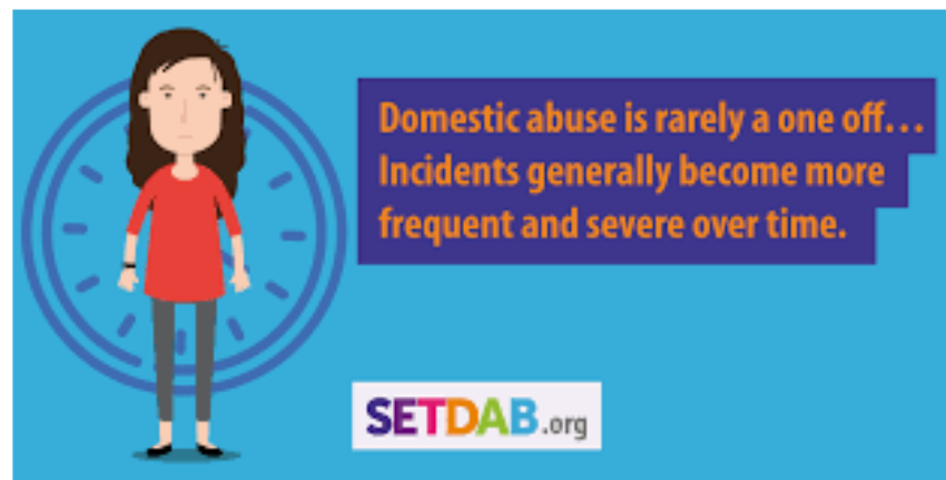
Estimated Socio-Economic Cost of Domestic Abuse Across Southend, Essex & Thurrock, 2016-2017

The PFCC co-commissions domestic abuse services with Essex County Council, Southend Council and Thurrock Council. The whole contracted service includes Independent Domestic Abuse Violence Advisor (IDVA), Refuge and community support. The service is provided by a partnership of providers Safe Steps, Changing Pathways and The Next Chapter